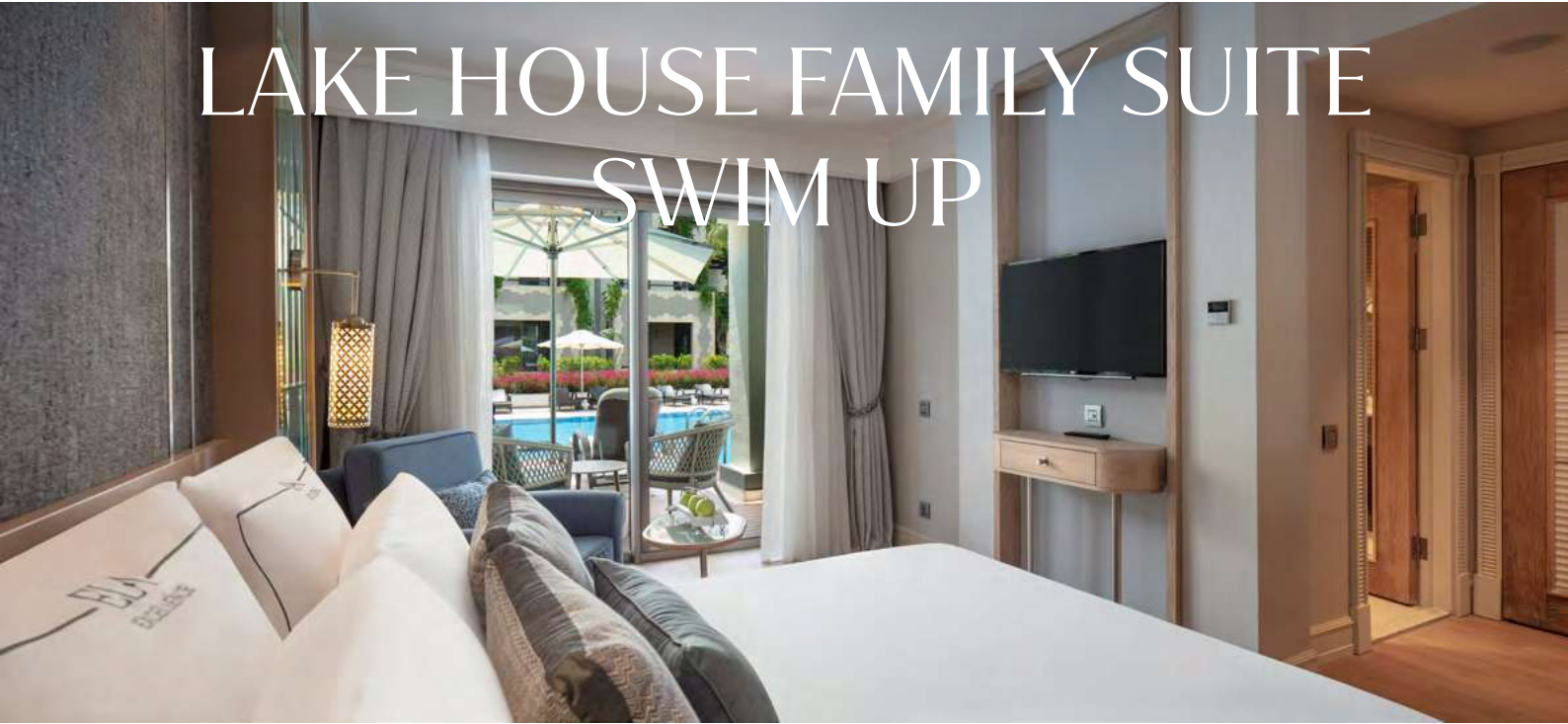
Lake House | 76 m 2 | 4 Adults + 1 Child

When you close your eyes and take a deep breath, you will realize that this moment is exactly the vacation experience you have been dreaming of.