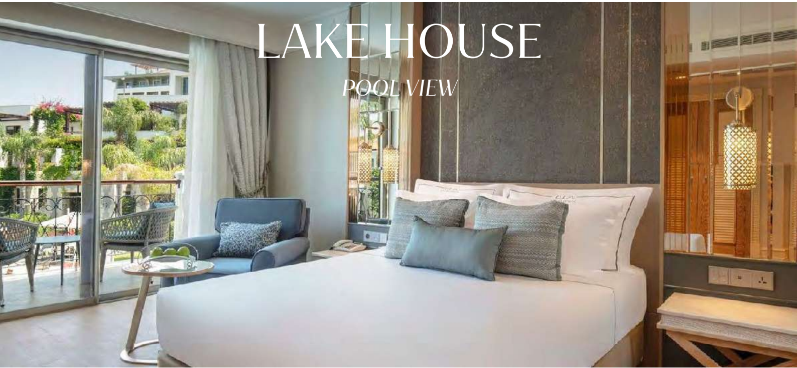
Lake House | 38 m 2 | 2 Adults + 1 Child

Enjoy a luxurious vacation in touch with nature in the Lake House Pool View room, which crowns every shade of green with Ela's elegant and charming touch.