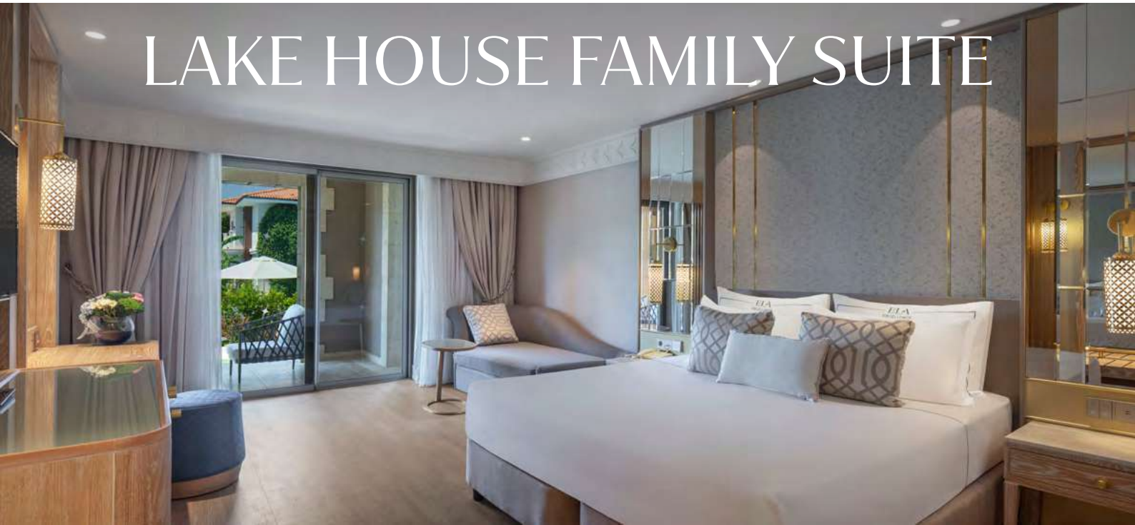
Lake House | 100 m 2 | 4 Adults + 1 Child

With spacious living areas and charming views, these suites offer the ideal setting for a relaxing family vacation.