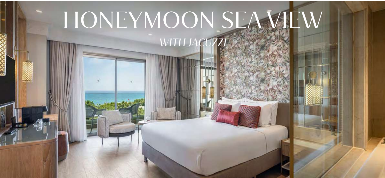
Main Building | 48 m 2 | 2 Adults + 1 Child

You will feel the calm of nature at every moment while experiencing your romantic moments in a fascinating atmosphere.