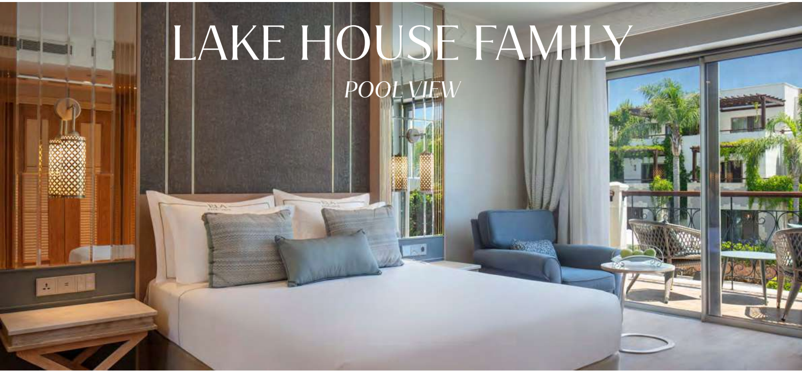
Lake House | 76 m 2 | 4 Adults + 1 Child

It is one of the most ideal room designs where you can enjoy the pool with your family after a walk in a lush nature. The Lake House family room offers an unforgettable vacation experience with your family inside the charming beauty of nature. Consisting of two separate bedrooms connected, these large and spacious rooms are designed for the comfort of families in every detail. You can feel the tranquility of nature through the balcony overlooking the lake.